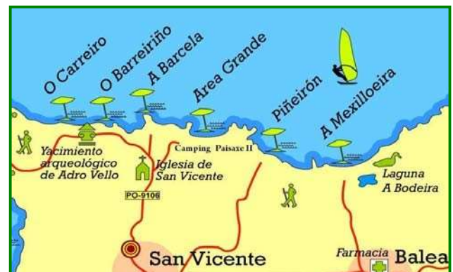
Situation plans and the area where the campsite is located