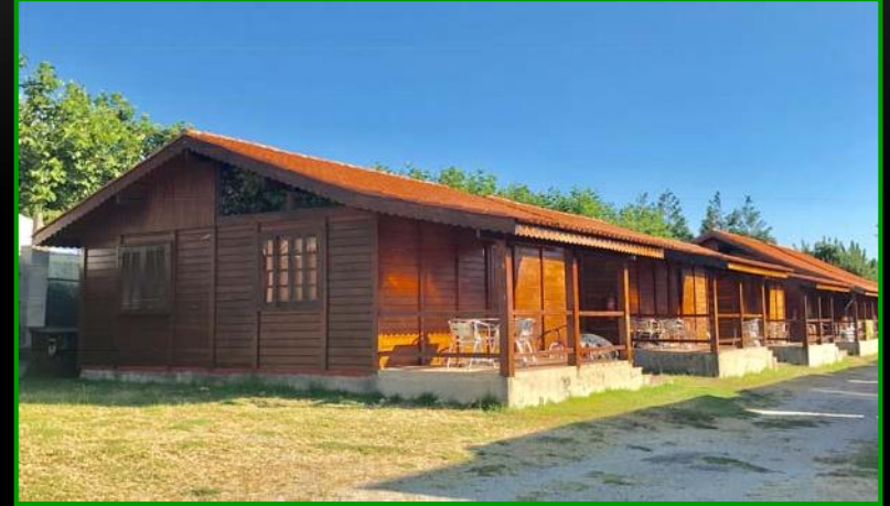
Bungalows full equipped