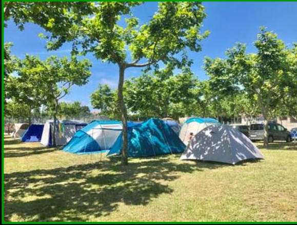
Land area for tents